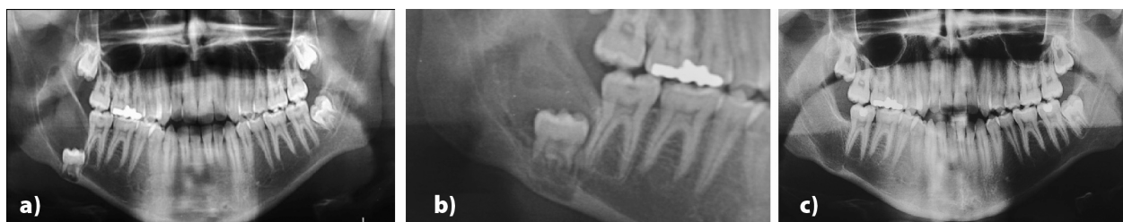
Fig. 1 – Preoperative panoramic radiograph shows a large radiolucent cystic lesion with the impacted third molar located at the base of the mandible [keratocystic odontogenic tumor (KCOT)]; b) Six months after decompression, the impacted third molar was moved to a more suitable position, making extraction much easier. Ongoing bone deposition decreased a defect, making enucleation less traumatic; c) Three years after enucleation, panoramic radiograph shows a complete healing of the former bone defect, without any suspicious sign of a recurrence.

oth in the cystic lumen (Figures 1a and b). It was the third molar that was impacted most often (83.33%) and all of them were extracted during enucleation (Figure 1c); 10 (77.77%) dentigerous cysts were associated with premolars – 8 (66.66%) mandibular and 2 (11.11%) maxillary. A total of 4 (22.22%) maxillary dentigerous cysts were associated with the canine. Just in one (7.14%) case the affected tooth was extracted, while in 13 (92.86%) patients the affected teeth were saved; of these, 12 (85.72%) teeth erupted spontaneously and 1 (7.14%) needed orthodontic traction (Figure 2a-c). Figure 3 shows the rough surface of active bone deposition favored by decompression in one patient.