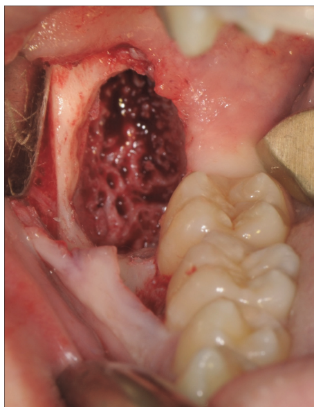
Fig. 3 – Clinical view showing the rough surface of active bone deposition favored by decompression.

All cystic lesions showed a complete osseous regeneration after enucleation, without complications. The mean duration of follow-up was 3.41 \pm 1.9 years, and no recurrences were noted.